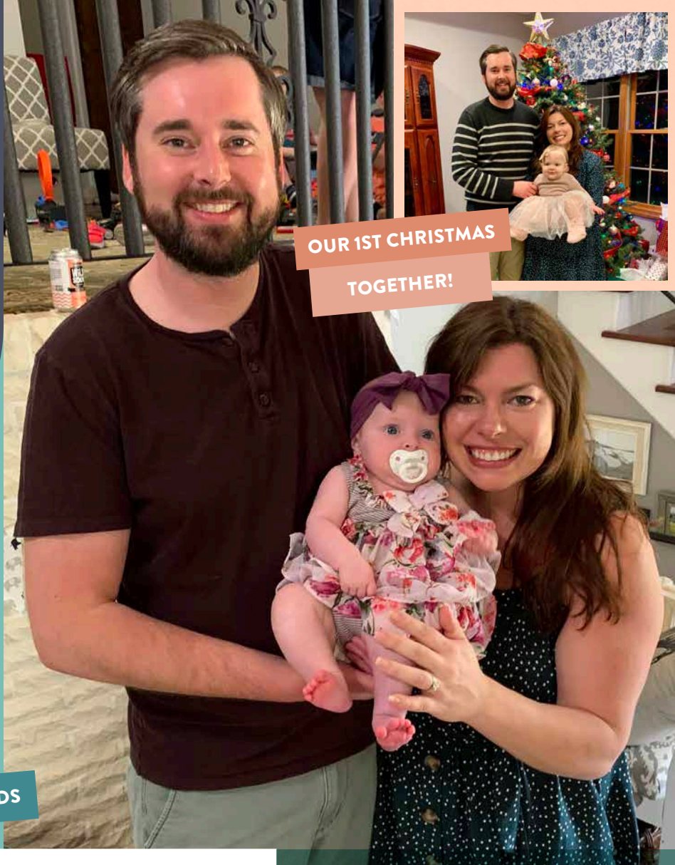
OUR 1ST CHRISTMAS TOGETHER!