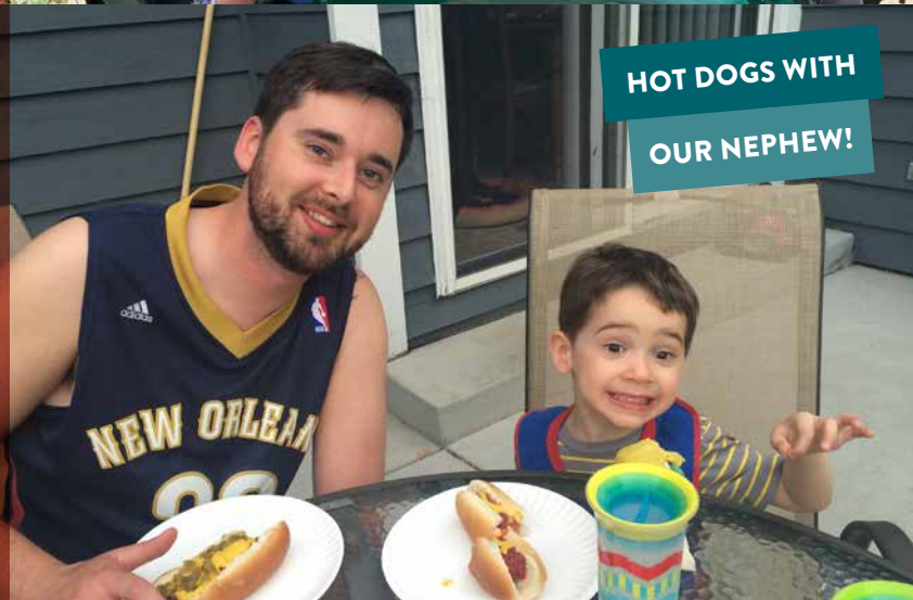
HOT DOGS WITH OUR NEPHEW!