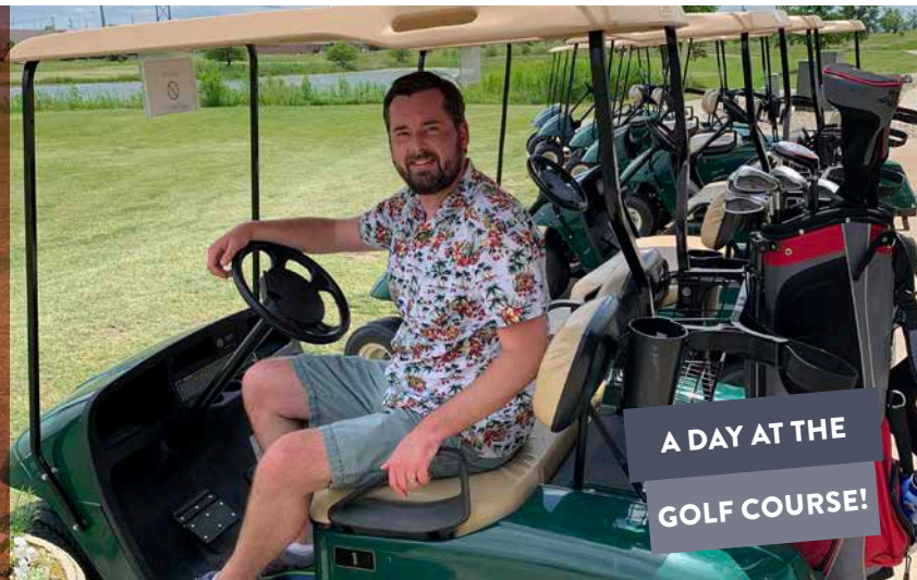
A DAY AT THE GOLF COURSE!